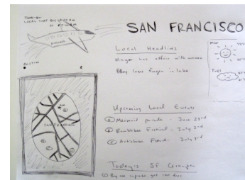
Figure 1: Paper prototype for booking a flight.

Users also reported a great diversity of situations, such as ripping and burning CDs, connecting to Wifi, syncing a phone, streaming web content, doing a backup, booking a flight, rendering video and logging off , although those situations were each reported only once.